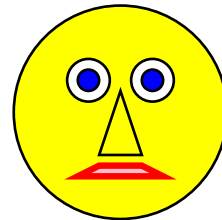
Figure 11-19: A sample widget

>>> from reportlab.lib import colors >>> from reportlab.graphics import shapes >>> from reportlab.graphics import widgetbase >>> from reportlab.graphics import renderPDF >>> d = shapes.Drawing(200, 100) >>> f = widgetbase.Face() >>> f.skinColor = colors.yellow >>> f.mood = "sad" >>> d.add(f) >>> renderPDF.drawToFile(d, 'face.pdf', 'A Face')